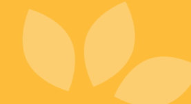
Chart # _____